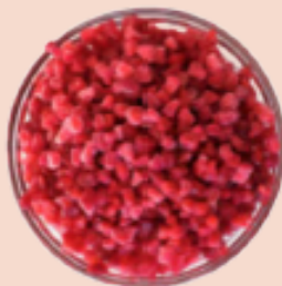
IQF Raspberry Crumbles