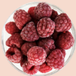
Individually Quick-Frozen (IQF) Raspberries