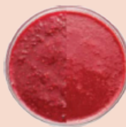
Sieved & Seedless Raspberry Puree