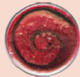
Raspberry Juice Stock or Concentrate

How to Order: Contact your preferred distributor and ask for frozen Washington red raspberries. Your rep can confirm availability, pack sizes and delivery timing.